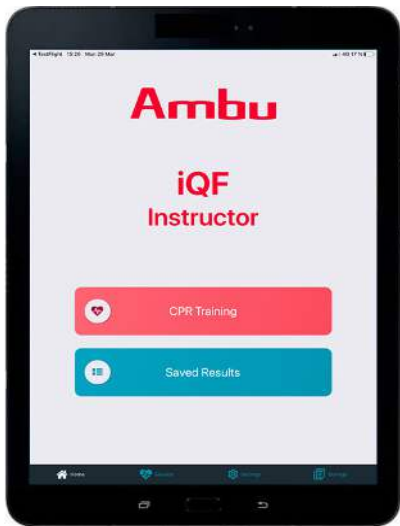
Ambu iQF Instructor

Help your students learn to perform a perfect cpr in a fun way with the option of games and competitions.